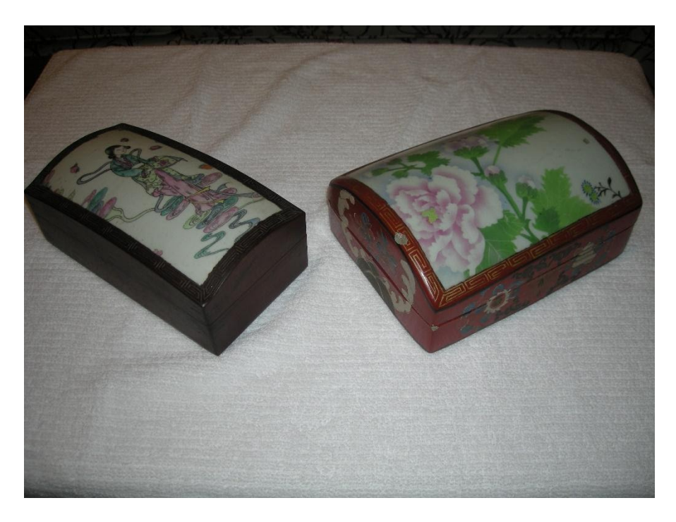
Two shard boxes belonging to the author.

Other shard boxes were formed of bright metal, tooled for interest, with the box again made specifically for a broken but beautifully-decorated piece of pottery.