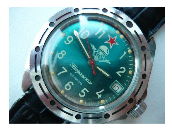
The author's Russian watch

On a trip to Laos in 1994, I happened to look into a small jewelry shop with some watches in the window. In front of me was a stainless steel dive watch with a Russian paratrooper's insignia on the dial. Intrigued, I asked to see the watch and found that it was manually wound but seemed to work fine. I asked about the price and was told that it was the Laotian equivalent of twenty dollars. I bought the watch, although the leather wrist strap was falling apart.