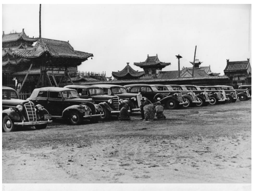
Cars of the guests waiting at the entrance of the Bogdo Khan Museum Төлөөлөгчдийн унаа Голын музейн үүдэнд зочидоо хүлээж байгаа нь

Ноён Уоллэс, түүнд бэлэглэсэн Монгол дээл, малгай, гутлаа өмсөн, Нүхтын аманд байрлаж байсан өргөөнөөсөө гарч ирж байгаа нь