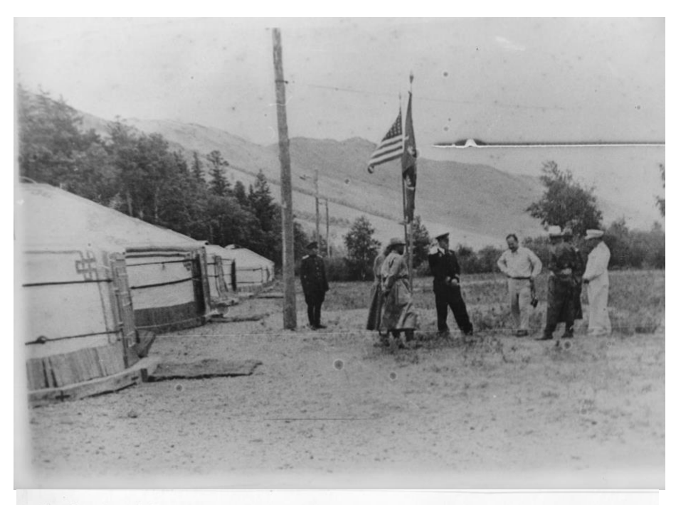
The American delegates talking with Mongolian officials—at the Nuhtyn Am Residence. Америкийн төлөөлөгчид Нүхтын амны байрнынхаа дэргэд Монголын албаны хүмүүстэй ярилцаж буй нь.

Буянт Ухаагийн онгоцны буудлаас толоологчдийг үдэж байгаа нь. Баруун гар талаас: Дэд ерөнхийлөгч X. Уолэ с, хэлмэрч О. Латтимор, ДЯЯ-ны сайд, маршал X.Чойбалсан, сонины ажилтан Ц. Дамдинсүрэн /эрдэмтэн/