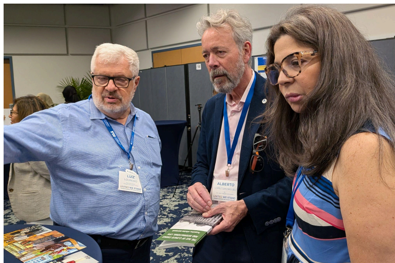
Fulbright Commission directors from Brazil, Spain, Mexico at poster, FACON2025